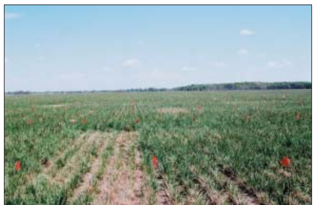
Figure 16. Wild oat herbicide damage on established tall fescue.