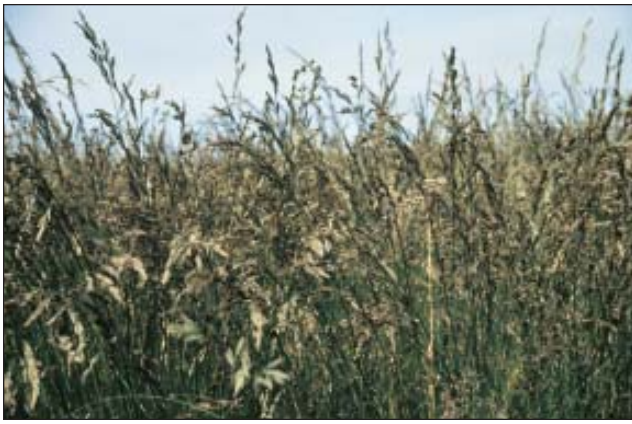
Figure 3. Tall fescue seed heads.

Tall fescue is cross-pollinated and self-incompatible, and it will readily cross with species such as meadow fescue and perennial ryegrass.