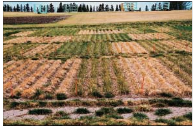
Figure 5. Winter hardiness differences in tall fescue varieties.

Tall fescue is adapted to a wide range of soils, but does best on heavy soils or moist medium-to-heavy textured soils. It tolerates soil pH ranging from 4.5 to 8.0 and has one of the widest ranges of soil reaction tolerance of the commonly grown grass species. Alkalinity tolerance is moderate, while acidity and salinity tolerance is high.