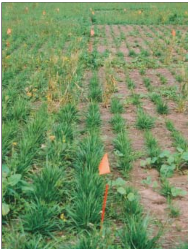
Figure 13. Sensitivity of seedling tall fescue to grassy weed herbicides.

** Number of trial sites included in the average % yield. Trials conducted at Edmonton, Beaverlodge and Rycroft, AB, Baldonnel, BC, Outlook, SK, and Arborg, MB, from 1998 to 2002.