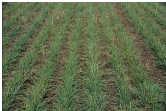
Figure 12. Tall fescue seeded in rows generally results in higher seed yields than broadcast seeding.

In the Peace River Region, research indicates seed yield can be optimized for at least 3 consecutive years by establishing an initial density of 20 to 100 plants m -2 in rows 20 to 60 cm apart. If maximizing first-year seed yield is a priority, the initial establishment should be a density of 25 to 50 plants m -2 in rows 20 to 40 cm apart.