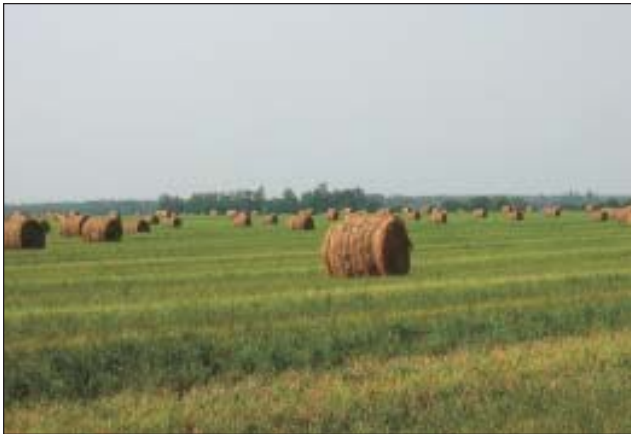
Figure 23. Tall fescue straw can have good feed quality.

A subsequent benefit of growing tall fescue seed crops is that seed producers can make use of the straw for livestock feed and possibly fall regrowth for grazing (Figure 23). However, producers must be aware that the endophyte Neotyphodium coenophialum may be present in tall fescue turf varieties (and the older forage-types), and it is important that they understand the effects that endophytes can have on livestock when utilizing straw, fall regrowth and especially seed screenings (see below). Endophyte-infected varieties of tall fescue are currently being developed that do not cause toxicity problems when fed to livestock.