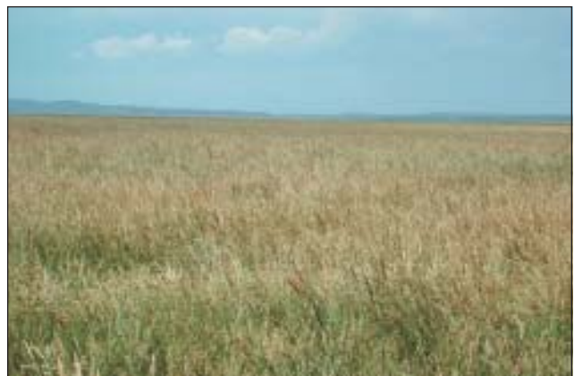
Figure 22. Irrigated tall fescue seed field in southern Alberta.

The tall fescue crop will be ready to swath anywhere from late July to early August. The seed heads will be brown at the top with a tinge of green, and 5 to 15 per cent of the seeds will be immature. Seeds will be in the hard-dough stage. Tall fescue is generally swathed as the risk of shattering is quite high, as the crop can lose 2 to 3 per cent moisture per day under good weather conditions.