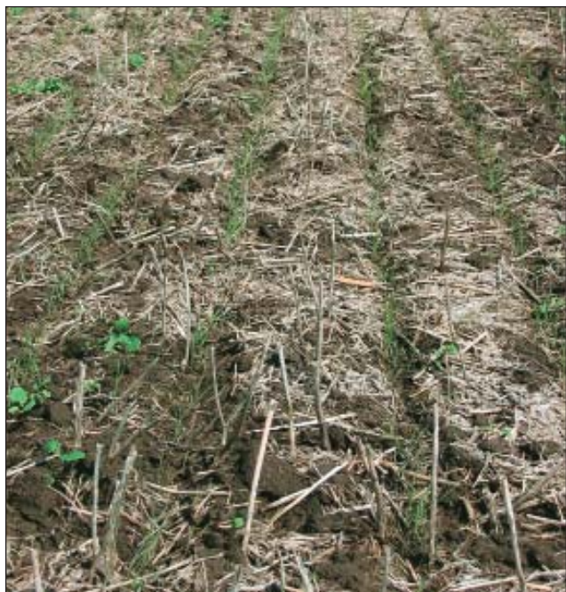
Figure 11. Direct seeding tall fescue into canola stubble is an excellent method of stand establishment.

Soil tests should be conducted to determine nutrient requirements for fertilizers that can be applied before or at seeding. If phosphorus and potassium are required, apply a sufficient amount before seeding to provide adequate nutrients to last the expected life of the stand. Once the stand is well established and weeds have been controlled, nitrogen may be applied to increase the development of tall fescue seedlings.