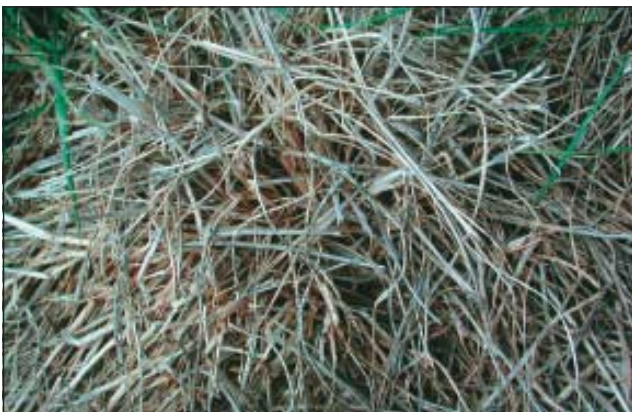
Figure 4. Winter injury on tall fescue plant.

Tall fescue has moderate winter hardiness (Figures 4 and 5). Winterkill may occur when winter onset is rapid and plants haven't started going dormant, during periods of drought, when snow cover is insufficient or when plant dormancy is broken too early. Although tall fescue does well under moist conditions, it is only moderately drought tolerant. It grows better in open, sunny locations.