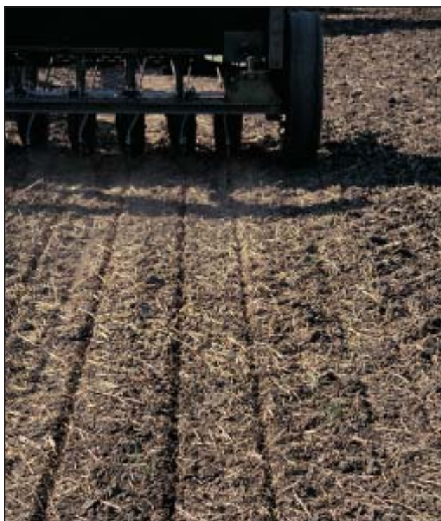
Figure 10. Seeding tall fescue into a firm, tilled seedbed.

Seedbed preparation in the previous fall or very early in the spring promotes the germination of some weed seeds and reduces soil moisture losses from excessive cultivation. Tall fescue can be seeded one to two weeks after the last spring cultivation and sprayed with a glyphosate product before seedling emergence (Figure 10).