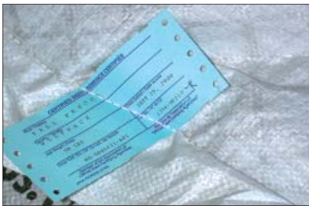
Figure 6. Tall fescue seed bag label.

If the seed does not meet the standards as outlined, the price to the producer will be substantially reduced. Seed produced under contract is generally grown for certified production. Production contracts help ensure the producer's profit potential, but it is very important for producers to fully understand the contract before signing.