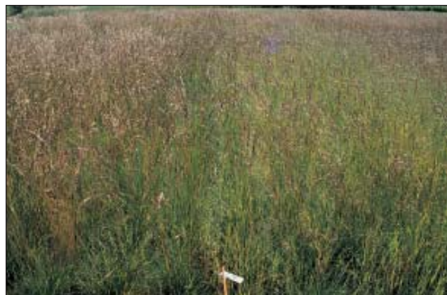
Figure 14. Effect of wild oat competition on seedling tall fescue the year after establishment.