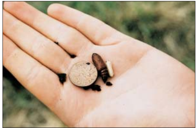
Figure 19. Glassy cutworm pupae.