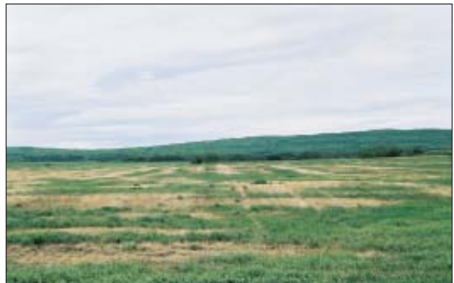
Figure 20. Grass seed field damaged by glassy cutworm.