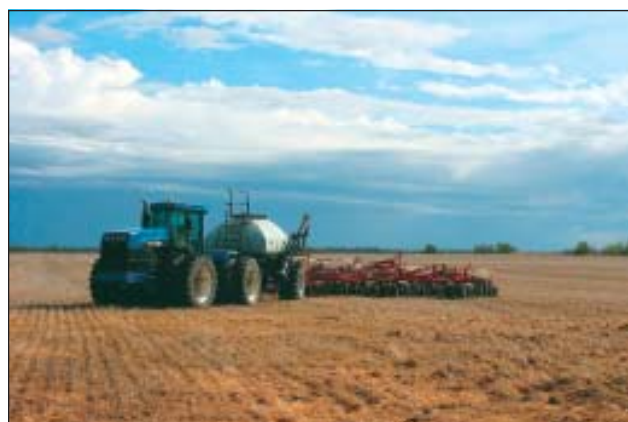
Figure 24. Direct seeding an annual crop into a tall fescue stand sprayed out the previous fall.

Most cereal, oilseed and pulse crops can be direct seeded into sprayed-out tall fescue stands. The annual crop selected will depend on seedbed conditions, potential soil herbicide residues and in-crop herbicide options.