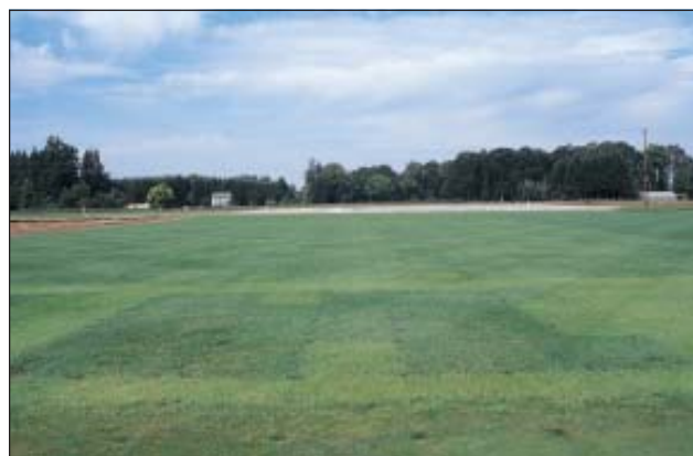
Figure 2. Tall fescue turf variety evaluation trial.

conditions or under irrigation, yields have ranged from 700 to 1,500 kg ha -1 and under minimal moisture from 200 to 900 kg ha -1 . Generally, seed fields are kept in production for two to four years