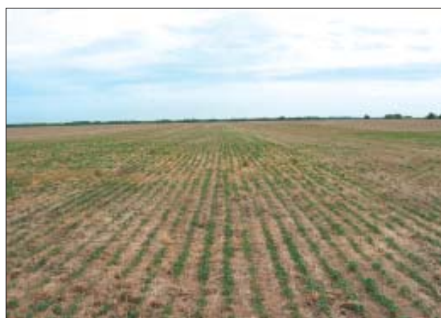
Figure 25. Emergence of glyphosate-tolerant canola direct-seeded into tall fescue sprayed in the spring.

Direct seeding glyphosate-tolerant canola into sprayed-out stands has worked very well as in-crop applications of glyphosate can control volunteer tall fescue and perennial weeds that may be present (Figure 26). Oats has also been shown to be a good crop to grow when direct seeded into sprayed out forage stands.