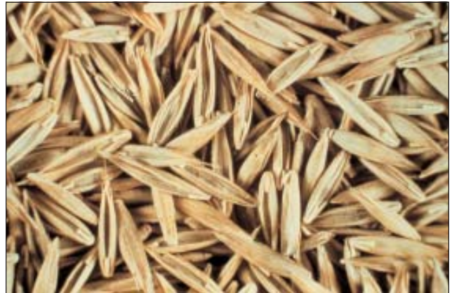
Figure 7. Tall fescue seed.

The price received by the grower for tall fescue seed (Figure 7) is determined by the variety contracted and the quality of the seed produced. Quality is evaluated in terms of weed seed contamination, germination and purity. Specific weed seeds can cause problems depending on the destination and end use of the final product.