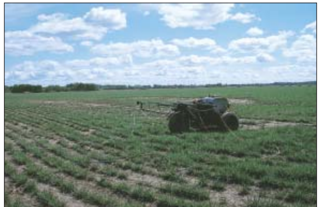
Figure 15. Modified ATV used for spot spraying in tall fescue seed fields.

Table 11 lists the herbicides currently registered for use on established tall fescue, the herbicides causing no injury to moderate injury and the herbicides causing severe injury to established tall fescue in research trials, usually applied in the spring before the shot blade stage. Only herbicides that are registered for use on tall fescue can be recommended.