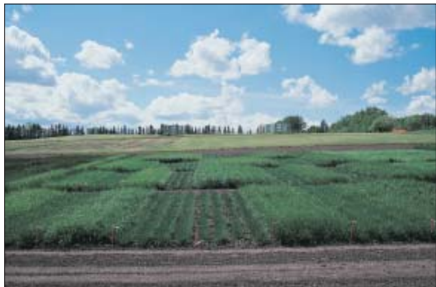
Figure 8. Tall fescue variety seed yield evaluation trial at Beaverlodge, AB.

The Western Canadian Grass Seed Testing program, an industry-sponsored testing program, can be a source of yield information for some tall fescue varieties. The latest information can be accessed from the web at http://www1.agric.gov.ab.ca/$department/deptdocs.nsf/all/crop9397