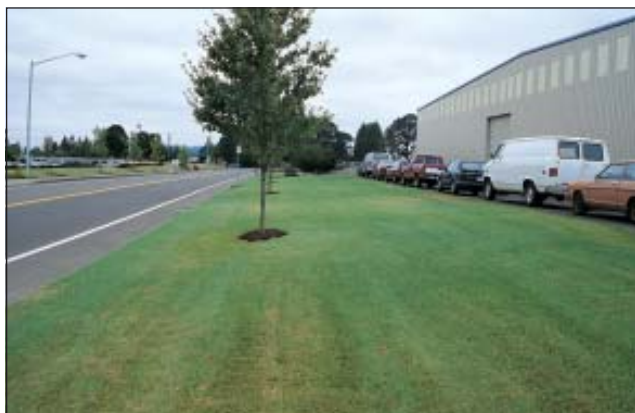
Figure 1. Tall fescue used in an urban setting.

Before the early 1980s, tall fescue varieties were developed mainly for forage production, but since that time, more turf-type varieties have been developed for recreational uses.