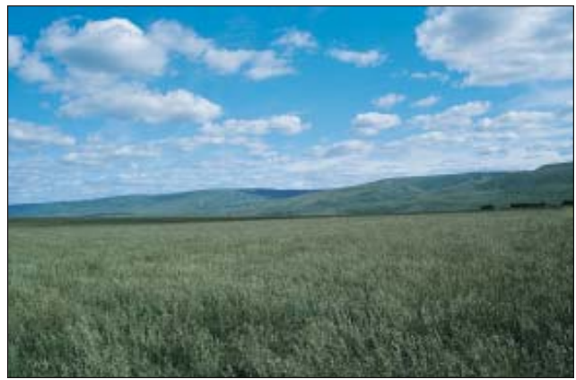
Figure 21. Tall fescue seed field in the Peace River Region of Alberta.

Generally, grasses require about 30 days from flowering to seed maturity (Figures 21 and 22). This period varies because flowering and seed development can last from several days to two weeks, resulting in seed heads emerging at different times and not ripening uniformly. Hot, dry weather reduces ripening time, and cool, moist conditions delay seed maturity.