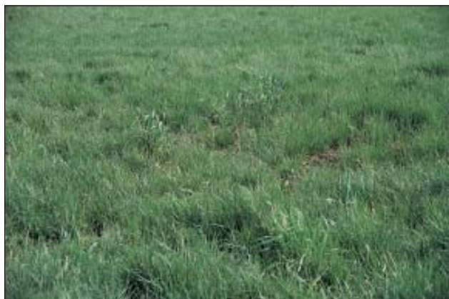
Figure 9. There is zero tolerance to quackgrass seed contamination in tall fescue seed.

Seed of other weeds such as foxtail barley, Canada thistle, perennial sow-thistle, Persian darnel, annual bluegrass, rough bluegrass, fowl bluegrass, downy brome and volunteer grasses are difficult to remove by cleaning. Applying glyphosate pre-harvest or post-harvest in annual cropping rotations for several years before seeding tall fescue can minimize most perennial weed problems. Even moderately weed-infested fields should not be used for establishing tall fescue for seed. Hand roguing or spot spraying of problem grasses will be required to meet quality standards.